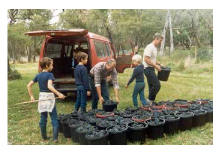
Vintage 1984 - Cabernet fruit