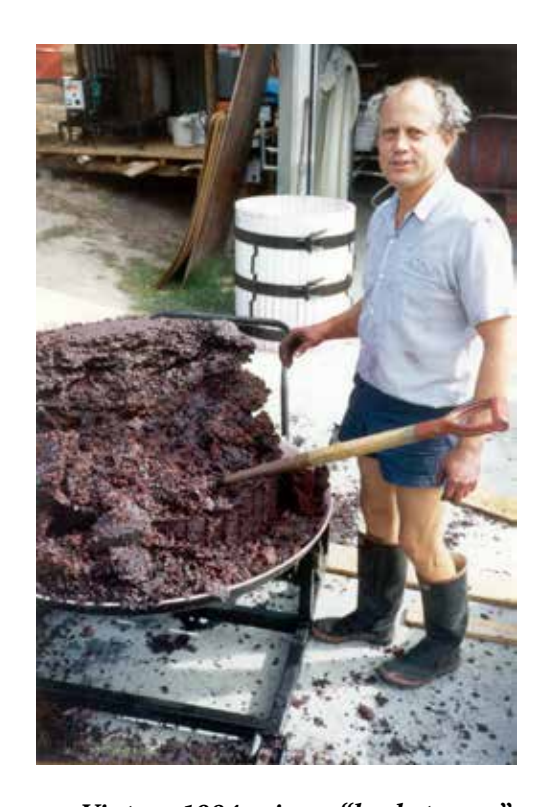
Vintage 1984 using a "basket press"