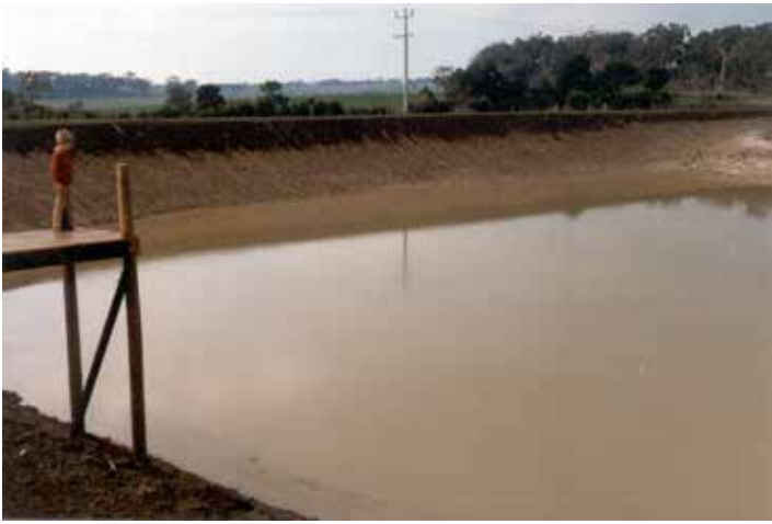
Building of the dam 1982

In 1982 we planted five acres of vines largely consisting of Cabernet Sauvignon, Chardonnay and a little Pinot Noir. These vines doubled combined existing plantings on the Peninsula bringing the total area to ten acres across the whole of the region. There are now in excess of 2000 acres and possibly 80 different vineyards throughout, many without a winery attached. (In fact, we are one of the few who have our winery here onsite on the Peninsula).