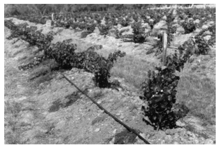
Cabernet vines 1983